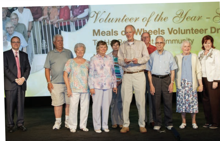
Right: Members of the Meals on Wheels volunteer group accept the award for Leading Age PA's Volunteer Group of the Year.

Volunteer groups were also cited for their faithful delivery of services to others. In the 2012 calendar year, the Mail Room volunteers were recognized on campus. In June 2013, Meals on Wheels volunteers were celebrated at LeadingAge PA's 50th anniversary conference in Hershey, PA as the organization's Volunteer Group of the Year.